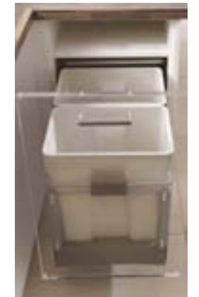
Pull Out Removable Bins