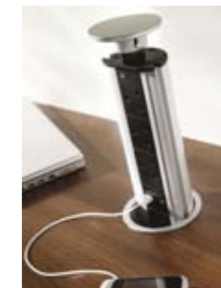
Pop-Up Socket with 2 USB Charge Points