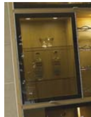
Reflective glazed unit (night)

Inside wall units or flap units with no ventilation under cupboard lights should be used instead of low voltage down lights.