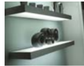
Box lit shelves