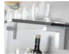
Square shelf bracket