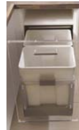
Pull Out Removable Bins