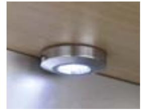
Surface mounted LED downlight

Modern lighting is an important feature within the design of your kitchen. Our extensive range offers a wide variety including the very latest styles and lighting options.