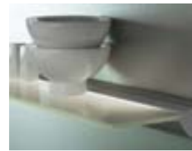
Edge lit glass shelf