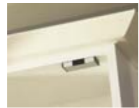
Door sensor switch