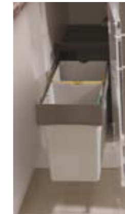
Pull Out Combi Waste Bin