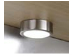
Fluorescent surface/recessed downlight