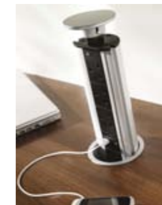
Pop-Up Socket with 2 USB Charge Points