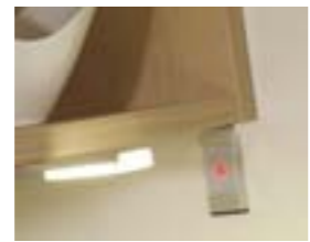
Touch sensor switch