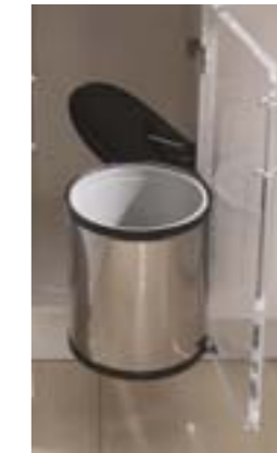
Swing Out Cylinder Waste Bin