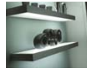
Box lit shelves