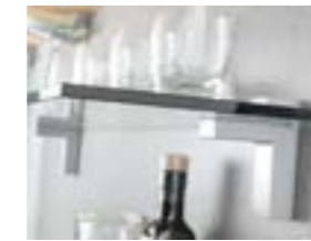
Square shelf bracket