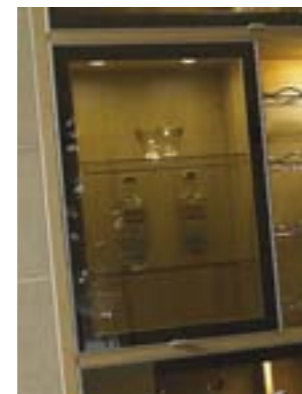
Reflective glazed unit (night)

Inside wall units or flap units with no ventilation under cupboard lights should be used instead of low voltage down lights.