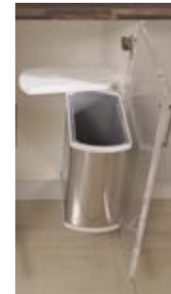
Swing Out Rectangular Waste Bin