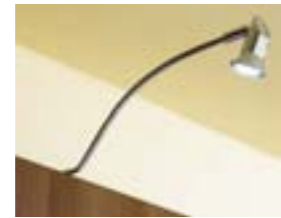
LED swan neck cornice light