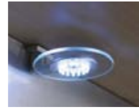
LED Glass under cupboard light