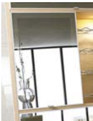
Reflective glazed unit (day)