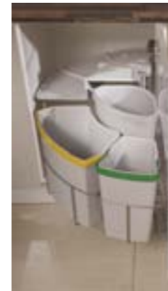
Swing Out Combi Waste Bin

To assist you with being environmentally friendly, we have a selection of recycling bins available, allowing you to easily and safely separate and dispose of unwanted kitchen waste.