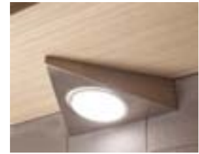
Fluorescent triangular under light