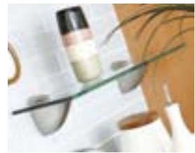
Glass shelf and bracket