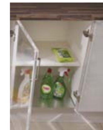
Base Unit with Drip Tray Protector