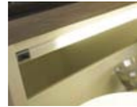
Internal drawer lighting