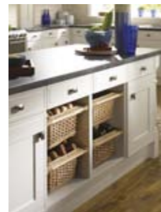
Wicker Storage Baskets

Storage should be both stylish and practical. Traditional wicker baskets not only look good they are a great place to keep fruit and vegetables. Look inside our units and you'll find we really have thought of everything. Below are a few hidden secrets but visit your Chippendale retailer to see more clever ideas that will make your kitchen function beautifully.